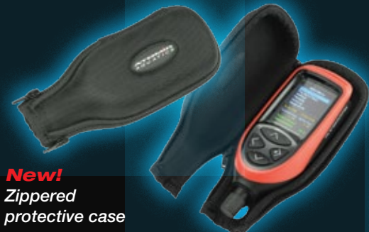
New! Zippered protective case

Pressing the "soft touch" rubber buttons of the Cobalt 2 activate leakproof magnetic switches. Press to make a momentary contact and release to make your selection. From any screen, pressing the BACK button repeatedly will return you to this menu.