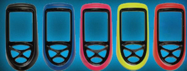
Cobalt Top Covers available in: Black, blue, pink, yellow and red.